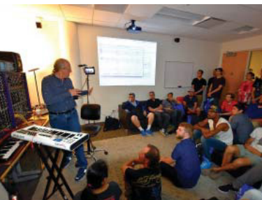
CHI 2017: Boddicker Modular Synth

IMSTA FESTA is a day-long celebration of music technology, attended by thousands of music makers of all levels of experience and proficiency. The purpose of the show is to connect manufacturers and consumers together in a vibrant space where each can learn, share and discover. IMSTA FESTA is a forum that projects IMSTA's message of respect for intellectual property via the slogan "Buy The Software You Use." IMSTA FESTA is FREE entry and hosts exhibits from the best music tech companies, master classes, industry panels, song reviews, and many other user-centric events that holistically supports the whole artistic aspirations of the mainly 16-32 year olds who attend. IMSTA runs a Song Competition in partnership with Blackrock Studios in Santorini Greece as well as maintains strategic partnerships with the SAE Institute, GRAMMY P&E Wing, MusiCares, NAMM, AES and many music retailers and publishers.