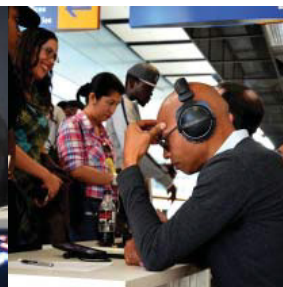
TOR 2015: Song Reviews