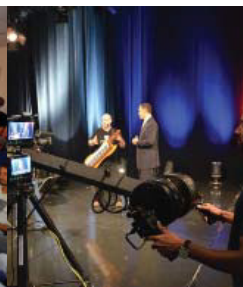
CHI 2015: WGN TV