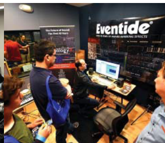
MIA 2017: Eventide Exhibit