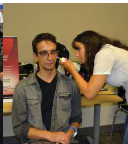
CHI 2017: MusiCares

To get an Exhibitor Kit or explore our excellent Sponsorship opportunities contact us today.