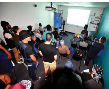
MIA 2017: Melodyne Tuning