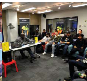
LA 2017: FL Studio Master Class